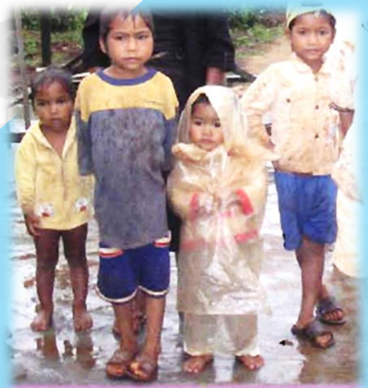
What will become of their future?