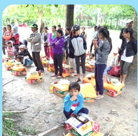
Poor villagers waiting for help