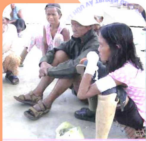
People suffering from leprosy